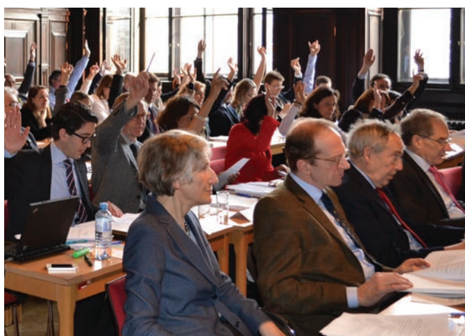
Meetings of the Council, Senate and Standing Committees set an agenda for the year ahead

As the ELI comes to the end of its third full year of existence, the Institute can look back on a year of change and progress. Meetings of the Senate, Council and several Standing Committees in February marked the first main event of the year, and saw an ambitious agenda set out for the months ahead. In accordance with suggestions from the Senate to streamline the ELI's administrative processes, the Council Composition and International Relations Committees were abolished, their responsibilities delegated to the Executive Committee and the Council at large. The Projects Committee was also dissolved, with the Executive Committee assuming its responsibilities until the planned subject specific interest groups are established.