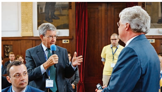
The project on Business Rescue in Insolvency law was discussed at the 2014 Projects Conference

on the topic were held in Vienna in 2013, meetings this year have mainly taken place in Rome at the headquarters of UNIDROIT, the ELI's partner institution in this venture.