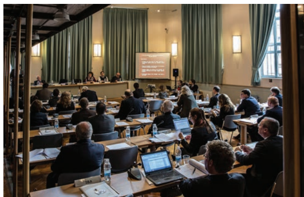
Project meeting in Rome, November 2014