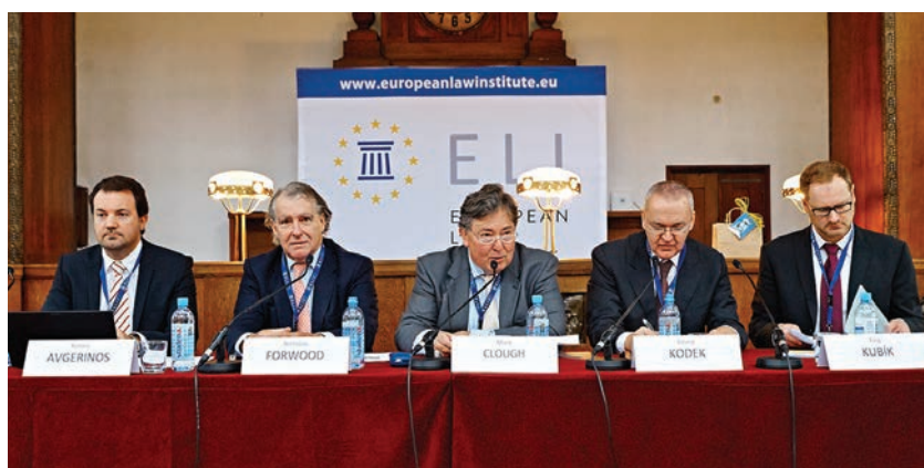
The 2014 Projects Conference devoted one of its panels to the project

In its decision of 12 December 2014, the ELI Council approved the Statement on Collective Redress and Competition Damages Claims. This Statement is the outcome of a project initiated under the auspices of the ELI on the basis of a project proposal approved by the Council on 3 September 2013, in Vienna. Since June 2013, when the European Commission launched its Recommendation on common principles for injunctive and compensatory collective redress mechanisms in the