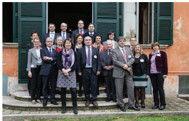
Members of the Steering Committee and Project Reporters

On 27 and 28 November 2014, the Steering Committee of the ELI/UNIDROIT project for the preparation of European Rules on Transnational Civil Procedure and the Working Groups set up for their preparation, held a Joint Meeting in Rome, at the seat of UNIDROIT. On the Agenda was a consideration of the progress made by the three Working Groups since their setting up following the meeting of the Steering Committee and Reporters in May, 2014 (Working Groups on Access to Information and Evidence, Provisional and Protective Measures and Service of Documents – see the Report on the May meeting in this Newsletter, May-June 2014 Issue . For summary reports by the Working Groups, see pages 3-4).