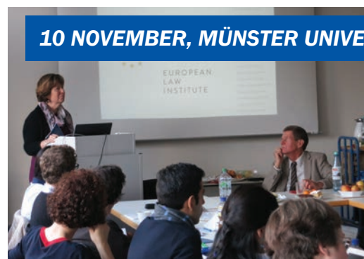
10 NOVEMBER, MÜNSTER UNIVERSITY

The event was well attended and provided an excellent opportunity for the work of the ELI to be presented to some prospective members and interested parties at close quarters.