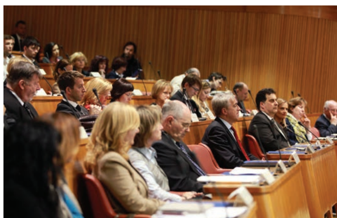
The launch of the Slovenian Hub in Ljubljana